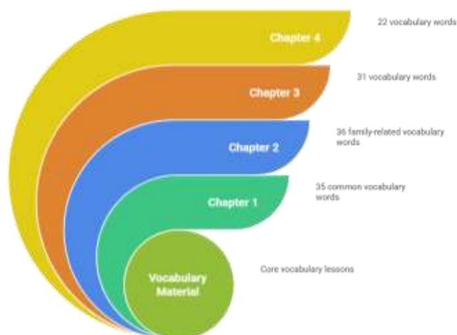
Figure 2. Arabic Book Vocabulary Analysis