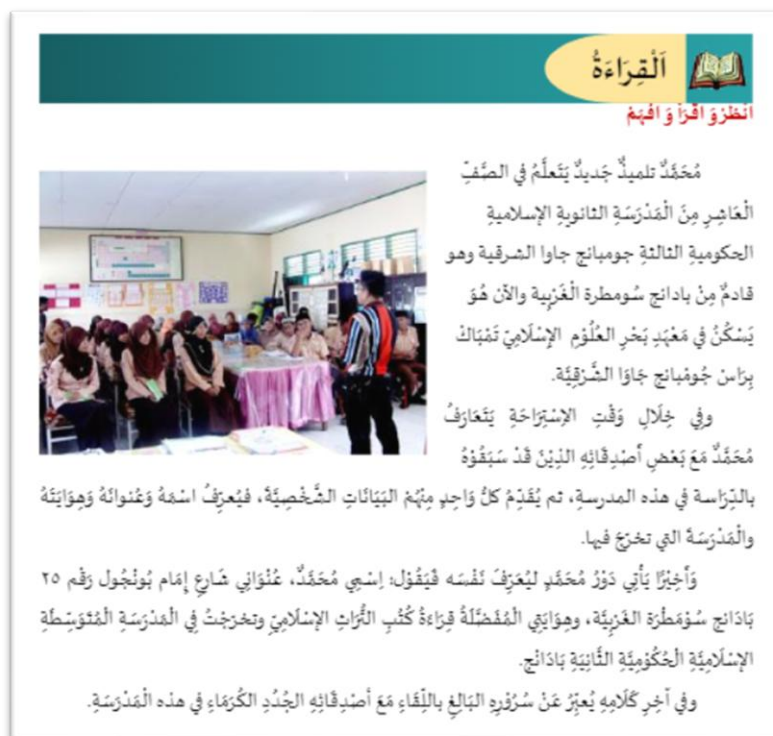
Figure 3. There are four language skills presented in each chapter discussion.

In the Arabic language subject, it is clear that it aligns with the competencies outlined in KMA 183 of 2020.